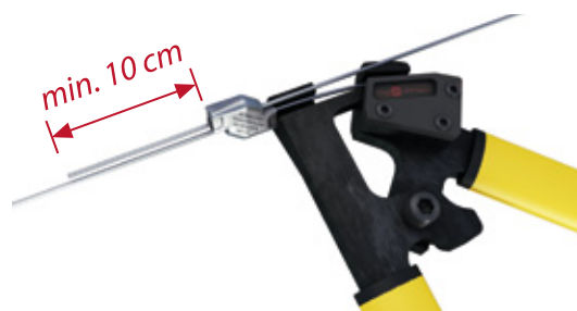
Fig.1 Tensioning of wire

To release the wire, the loosening wrench must be inserted into the smaller hole and then press until the wire holding mechanism is released. ( Fig.2 )